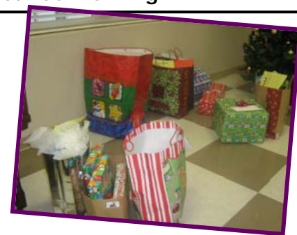
Gifts for children in need

Interested in learning more about Universal MH/DD/SAS? Visit our website at www.umhs.net .